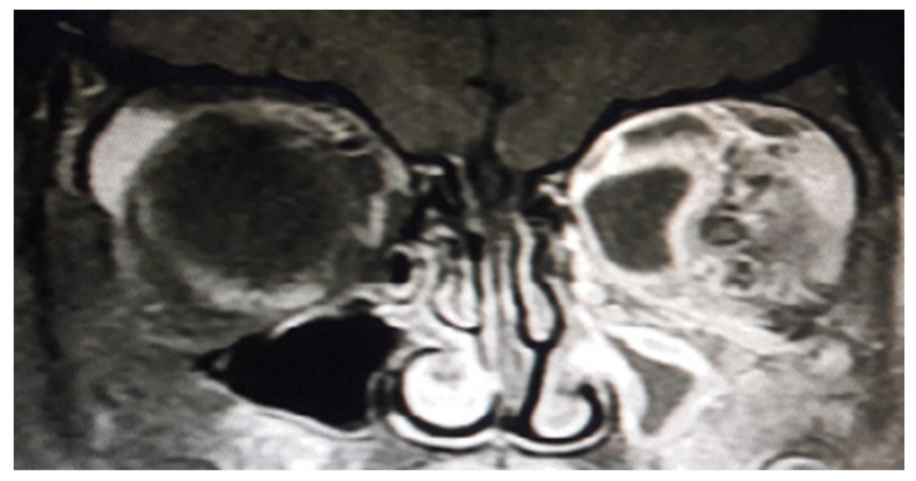
Figure 3: Axial and coronal T1 Fat SAT + Gadolinuim MRI sequence showing persistence of the subperiosteal abscess after the first surgery

Urgent decompression was again performed. No collection was found between the remaining part of the bony medial orbital wall and the periorbita, so the latter was incised and an abscess was identified and drained from the intra-orbital space. The boy markedly improved and his eye is almost normal on physical exam 10 days after the second surgery.